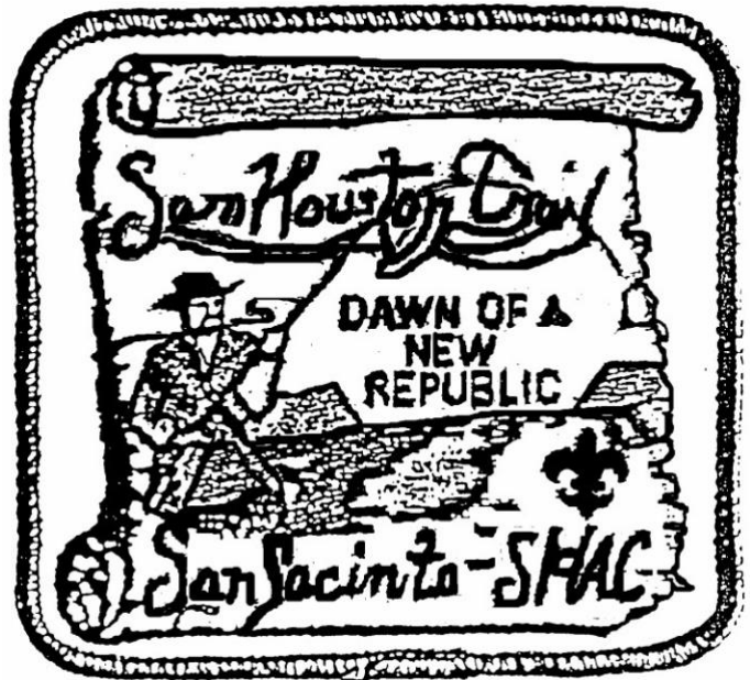
Sam Houston Area Council Boy Scouts of America